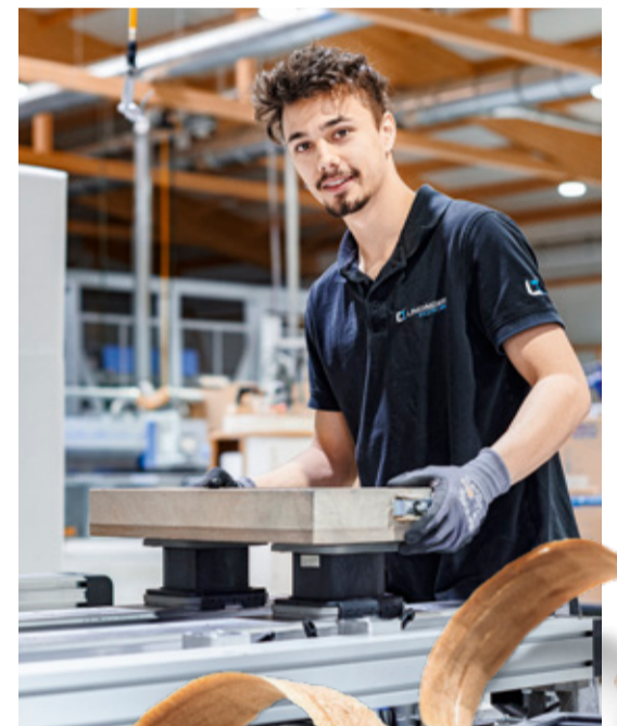
Always at full speed: the edge.