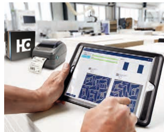
Easy to retrofit: label printing on HOMAG nesting machines.