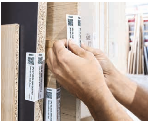
Each offcut receives an individual offcut label and is therefore uniquely identifiable.

The new „Nesting Production Set,“ brings the advantages of the cutting assistant to your nesting machine. The assistant supports you in the automatic calculation of your nesting patterns. The optimization software places the individual components in the nest as close to each other as possible. This allows you to reduce material consumption and save costs. At the same time, you print an individual label for each nested part. This ensures that each workpiece has all the information required for the subsequent processing. The set is the ideal entry level solution for labeling your components and is perfect for retrofitting label printing on HOMAG nesting machines. You can thus create the basis for integrated processing data in your joinery during the nesting process.