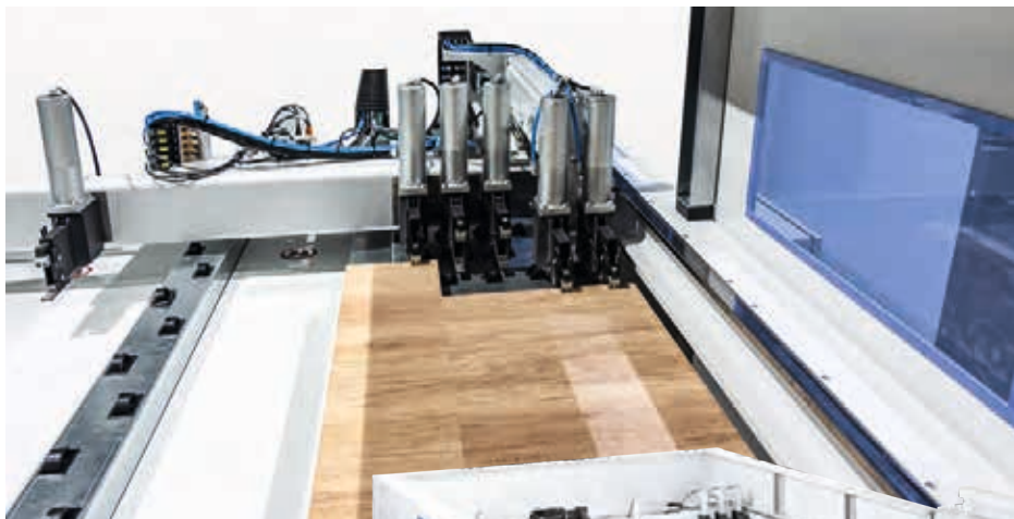
Power Concept Classic on the SAWTEQ B-130.

Power Concept Classic: Efficient sawing for woodworking shops.