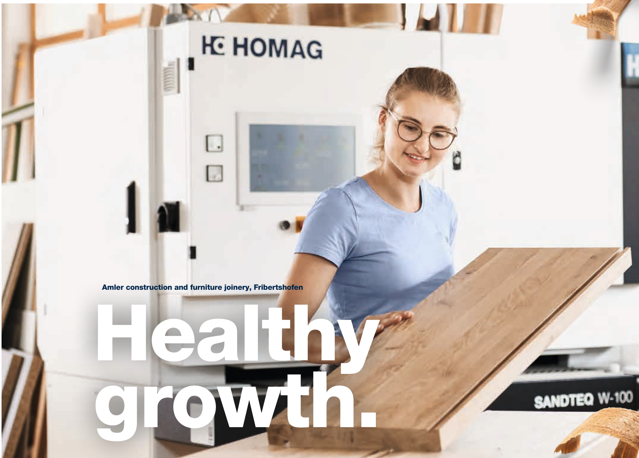
Amler construction and furniture joinery, Fribertshofen